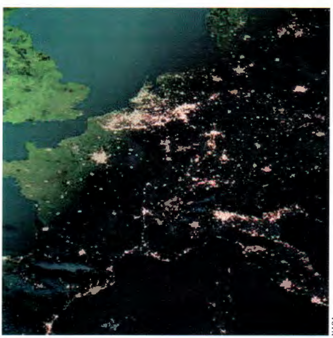
As the Sun sets, the lights of Europe come alive.

how many would you actually see? And how would this number compare with a star count taken at a different location? You may be surprised at how many stars in your skies are rendered invisible by local light pollution. Unfortunately, many of us must travel quite some distance to avoid the light pollution of cities, and enjoy a clear view of the stars.